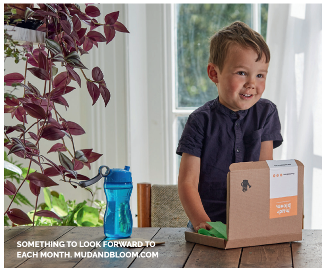
SOMETHING TO LOOK FORWARD TO EACH MONTH. MUDANDBLOOM.COM

Who can resist an unboxing? Here we share some of our favourite subscription boxes for toddlers from toys to clothes